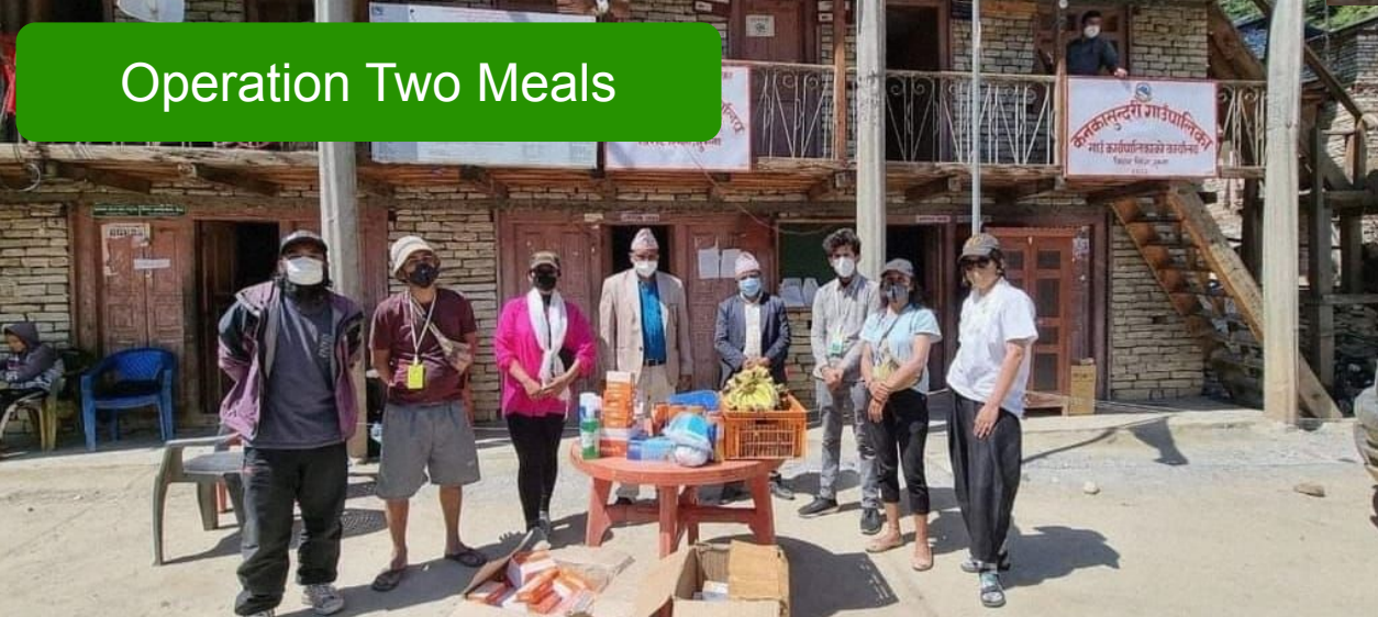
Operation Two Meals