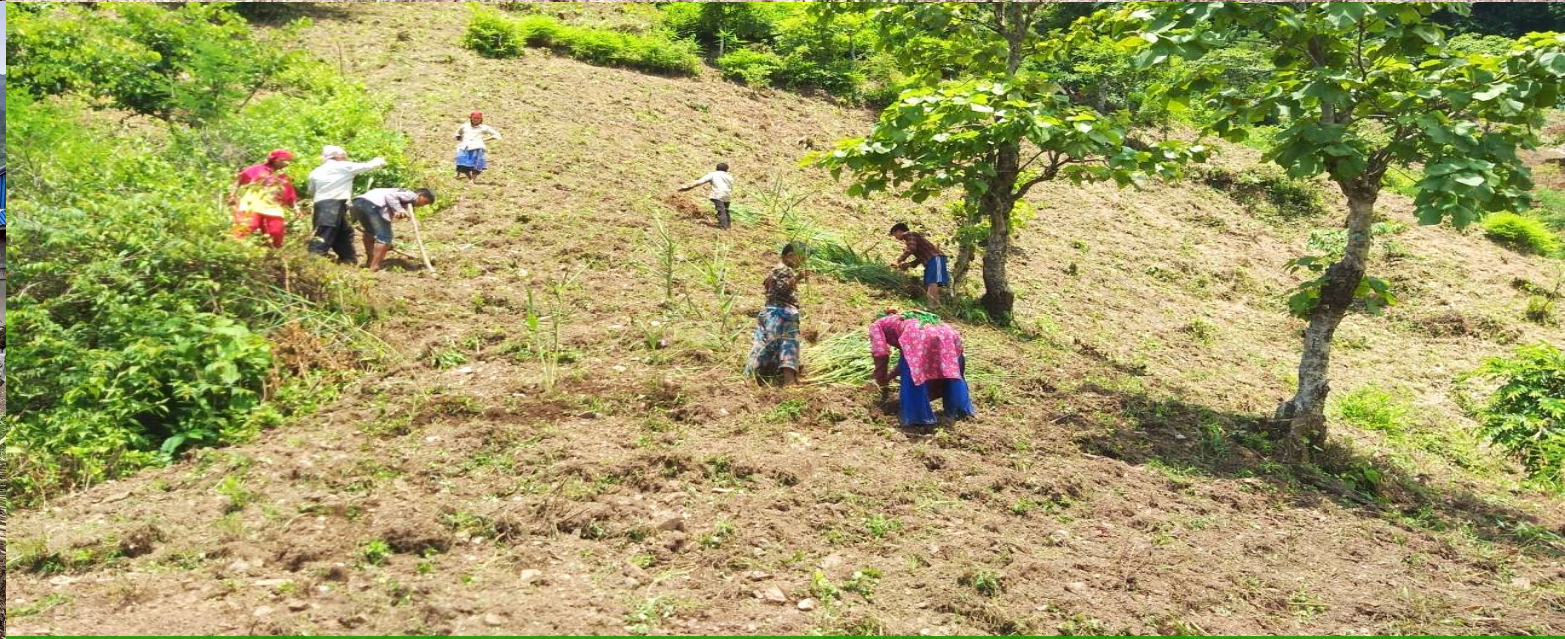
Sapling collection and plantation of broom grass on landslide prone areas