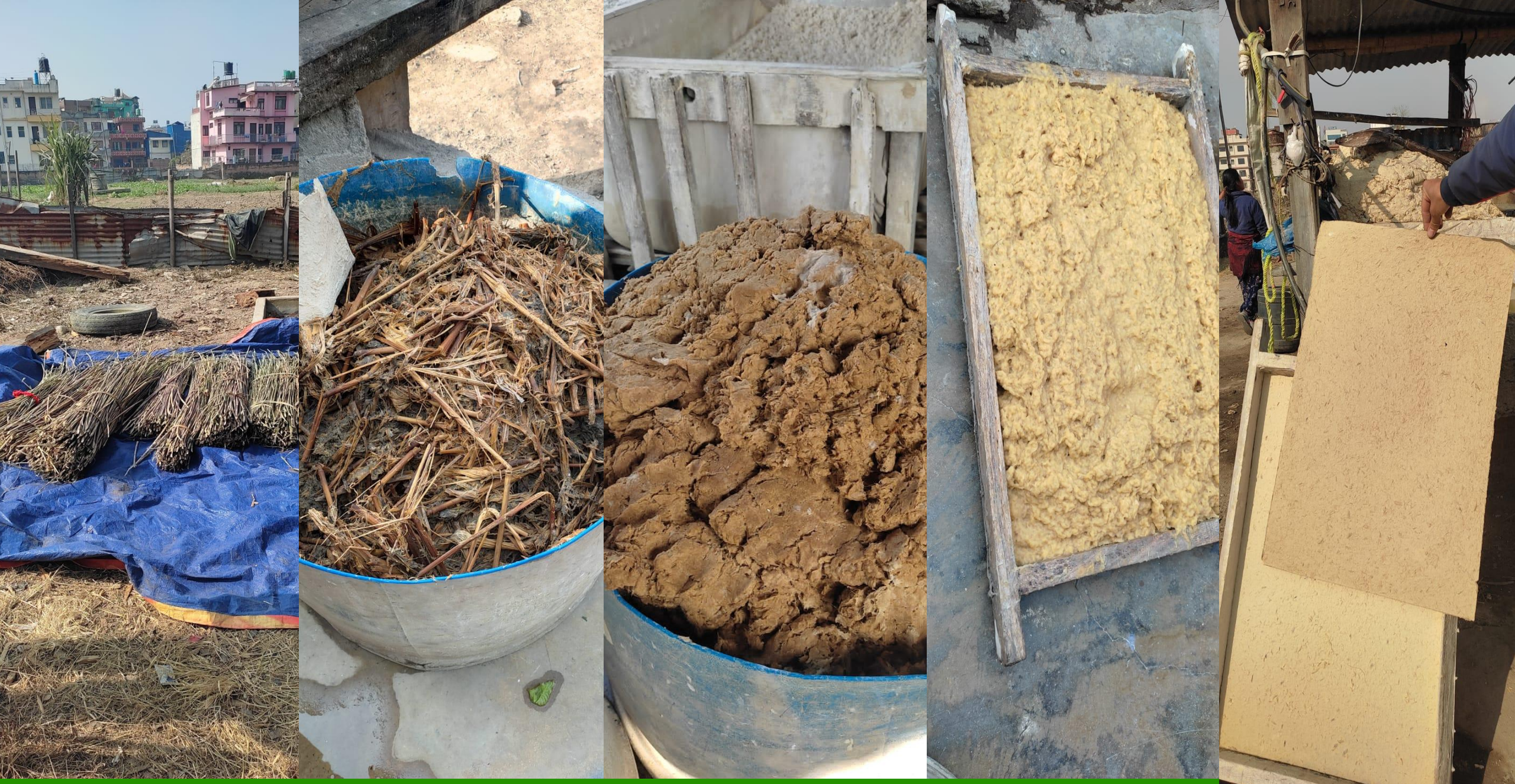
Agro waste management through paper production