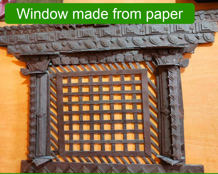
Window made from paper