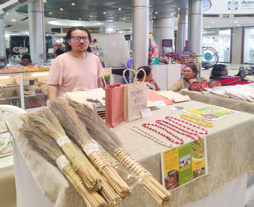
Connecting with the market