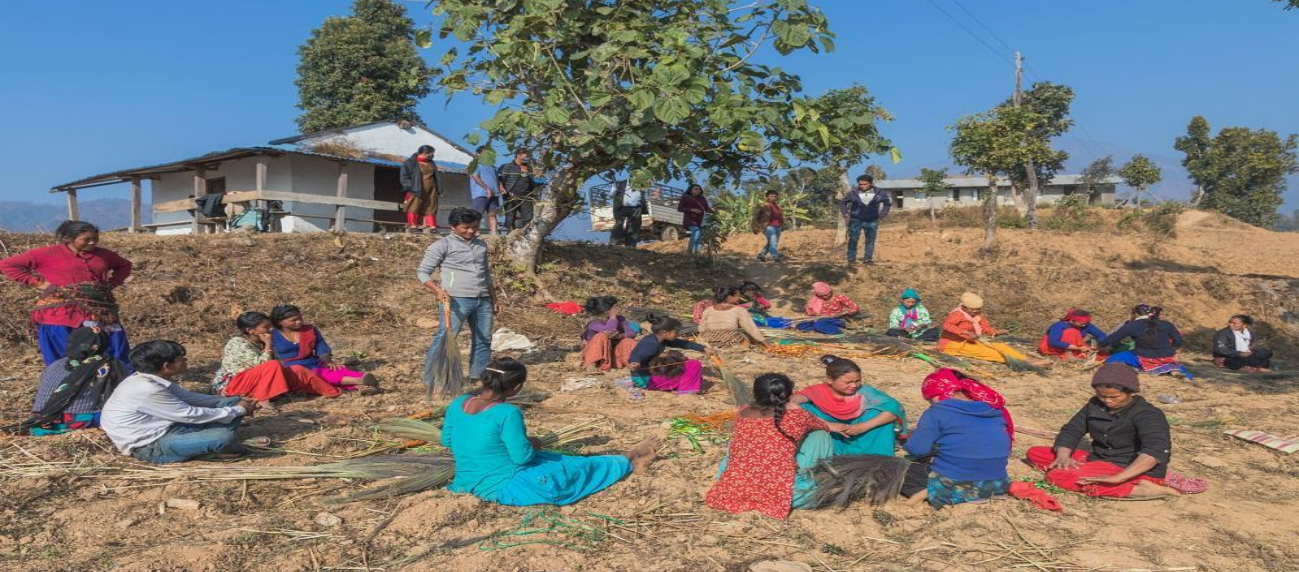
Training the beneficiaries on broom making