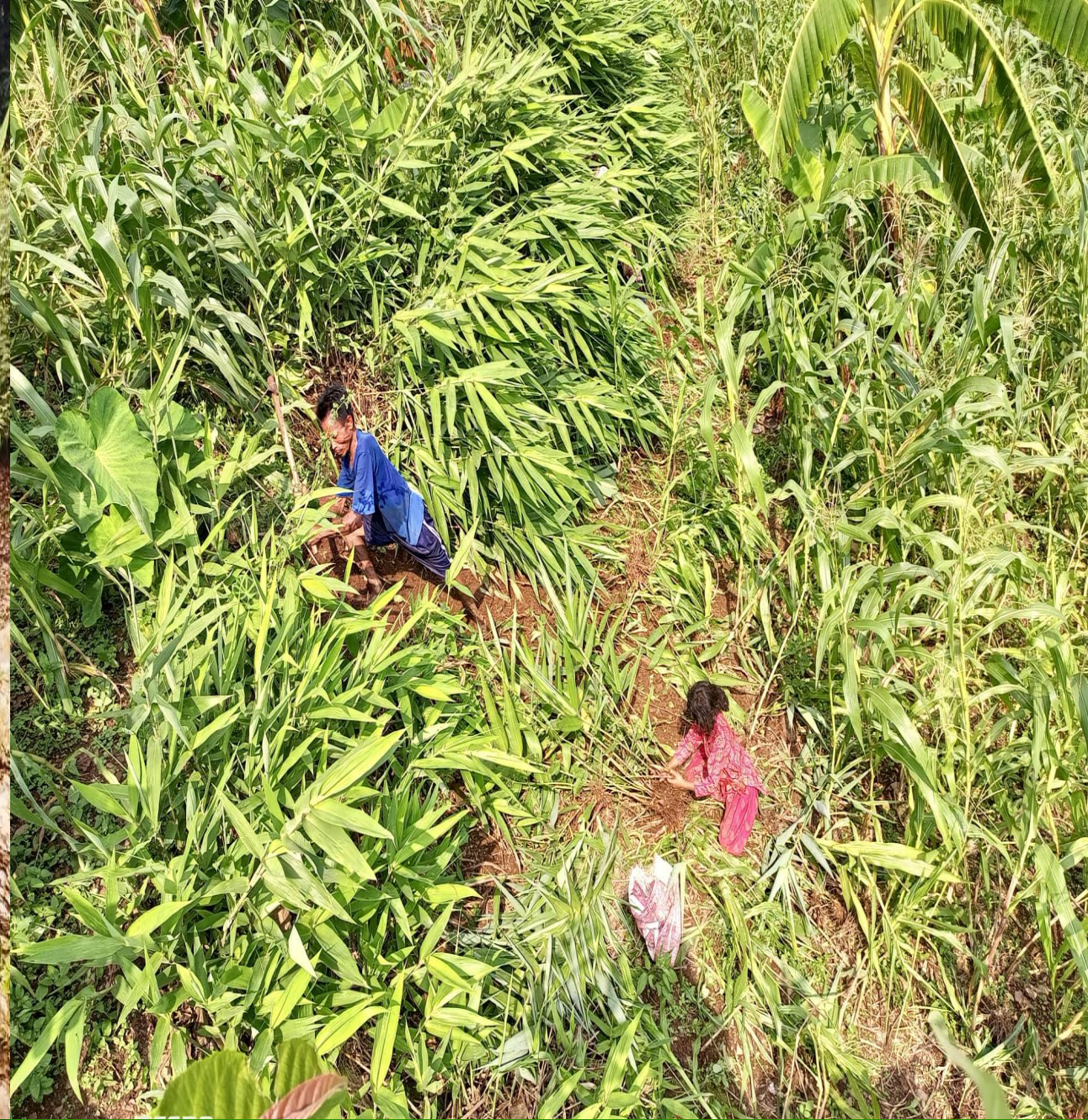
After the plantation