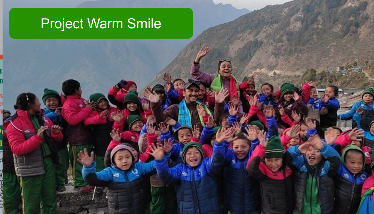
Project Warm Smile