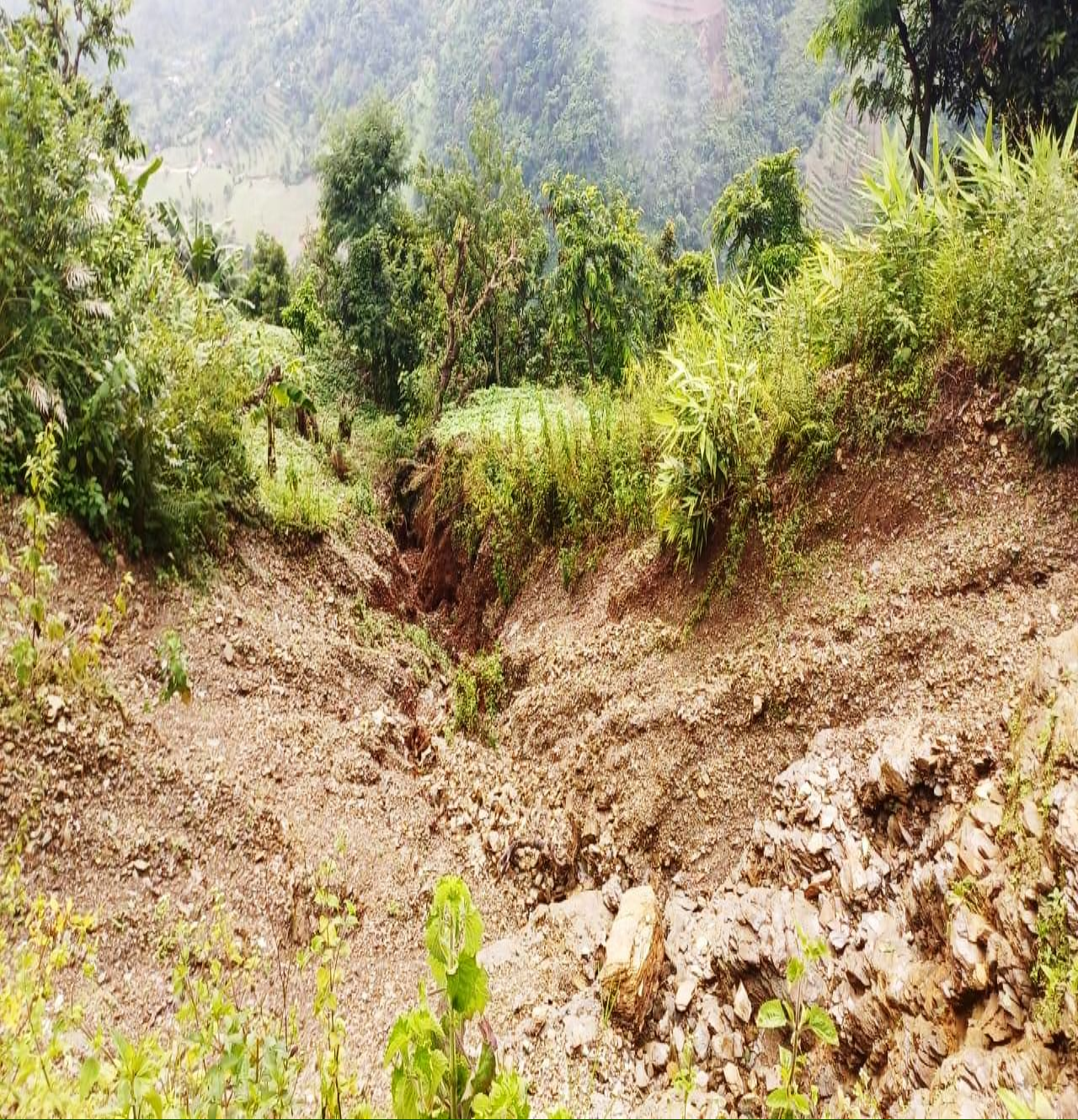
Before the plantation