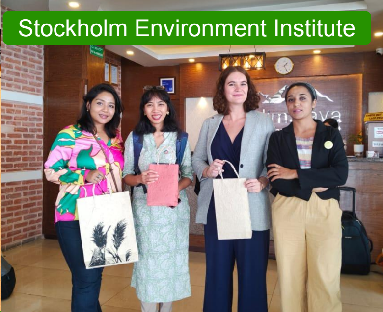
Stockholm Environment Institute