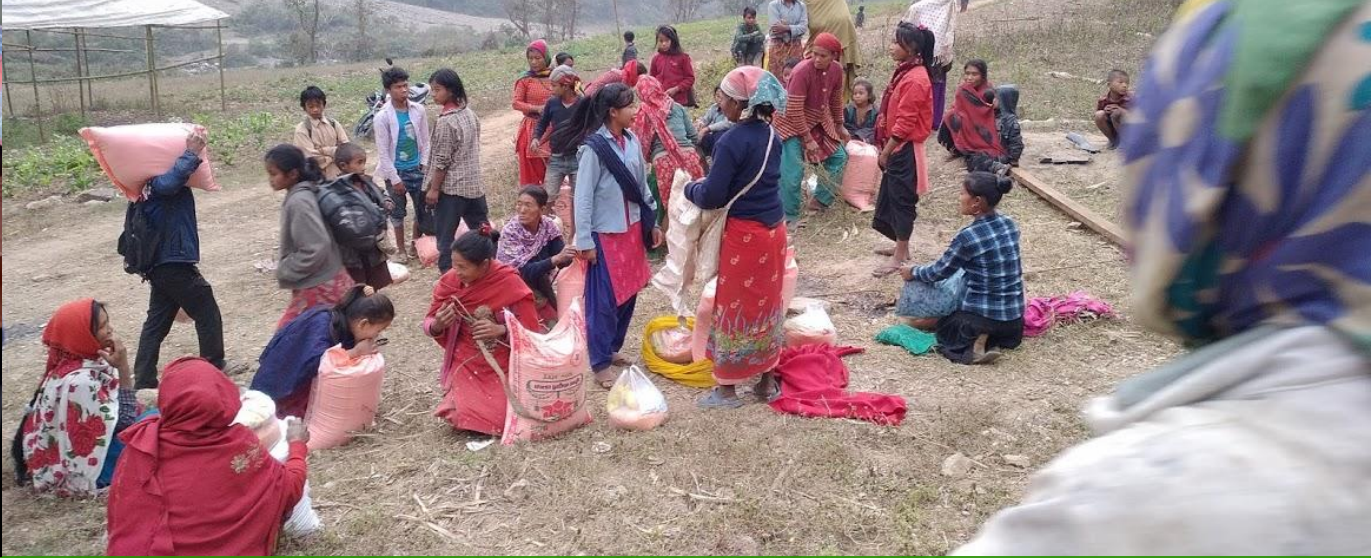
Distribution of food supplies as a labor charge for planting broom grass